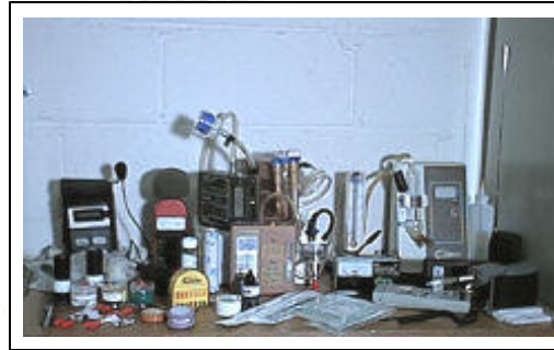
Industrial hygiene sampling instruments.

3rd - We create a custom package of safety programs, to include: procedures, equipment and training.